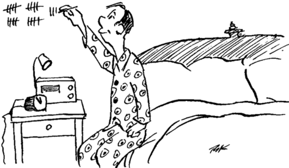
The First Ninety Days