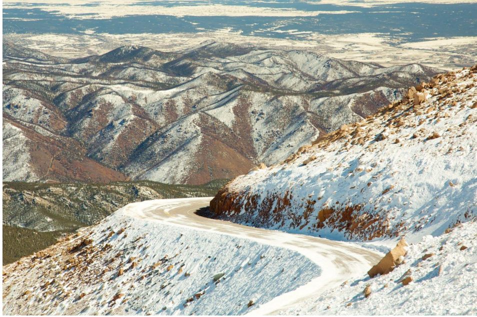
Pikes Peak image