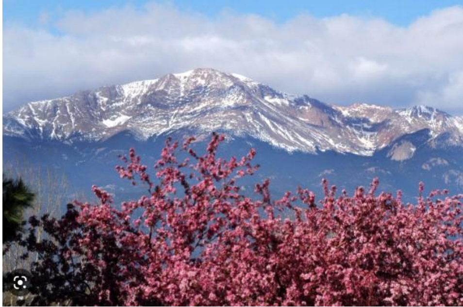
Colorado Springs and the Pikes Peak Region